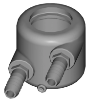
*External Electrode Cooling Chamber