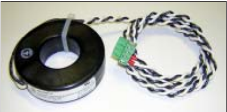
Primary Coil (P5)