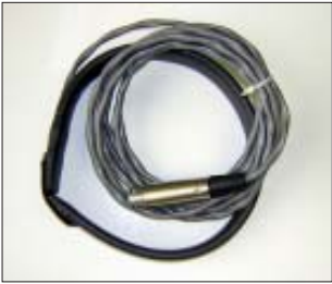
Rogowski Coil (S6)