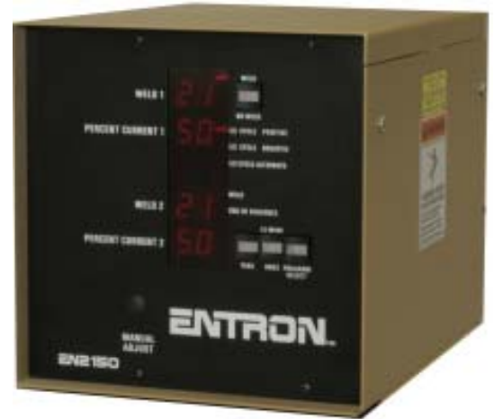
EN2150 Style "B" Cabinet 222mm x 222mm x 296mm 8-3/4" x 8-3/4" x 11-3/4"

Microprocessor-based Circuitry Spot Sequence Dual Weld/Dual Current LED Status Indicators All Functions Displayed Simultaneously Compact, Lightweight Air Cooled Cabinet Available with both 150 and 300A Air Cooled Contactors Error Code/Fault Outputs 87° First Half Cycle Delayed Firing, Anti-Saturation Circuit Dynamic Automatic Power Factor Equalization Dynamic Automatic Voltage Compensation, \pm 20\% of Nominal Line Emergency Stop Circuit Interlocking Pressure Switch Circuit Single Valve output standard (without transformer) Manual Current Adjust (optional)