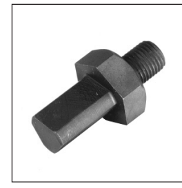
Stud Shank - SS-01