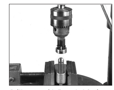
Drill press with Extended Series.